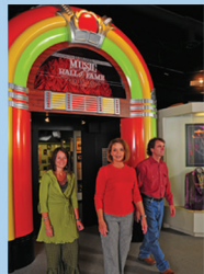
Alabama Music Hall of Fame