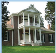
Belle Mont Mansion