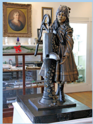
Helen Keller Home

HELEN KELLER HOME, "IVY GREEN" www.helenkellerbirthplace.org ; Home and gardens are open M-Sa 8:30 a.m. - 4 p.m.