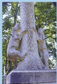
Coon Dog Cemetery