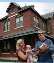
Tuscumbia Depot Museum