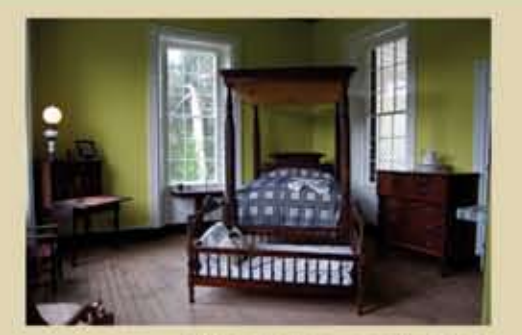
Master Bedroom on 2nd Floor

Subsequent generations of the Winston family enjoyed life at Belle Mont. When the family ceased using it as their primary residence, it